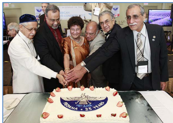
All six past FEZANA Presidents cut the FEZANA 25th Anniversary Cake at the Silver Anniversary Gala.

On the evening of August 2, 2012, in Rye Brook, New York, FEZANA held its 25th Year Celebration Gala. With all six past FEZANA Presidents present, guests were treated to a memorable evening filled with insightful presentations, acknowledgements to FEZANA supporters, and entertaining dance and music performances. [More photos on page 8. Also, see the upcoming FEZANA Journal, Fall 2012 issue] □