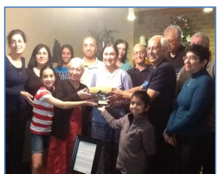
A replica of the Cylinder of Cyrus presented to representatives of ZAKOI

The original Cylinder of Cyrus the Great is housed in the British Museum and a replica of that is housed at the UN, evidencing a symbol of the Achaemenian dynasty of a people who were respectful of the rights of the other, even those vanquished in the battle, to practice their own religion without hindrance.